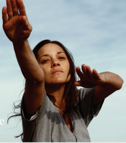
Rust And Bone