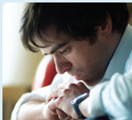
The Beat That My Heart Skipped